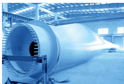
Wind turbine blades