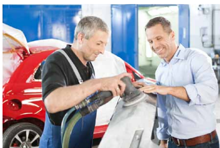
Car body crash repair