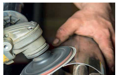
Steel sheet surface finishing